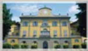
537 hotels from 3 to 5 star deluxe