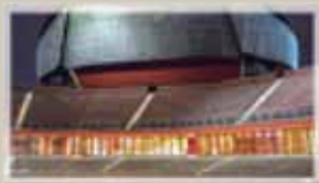
40 congress centres, up to 7000 seats

Hospitality, professionalism, services: your secret for a successful event.