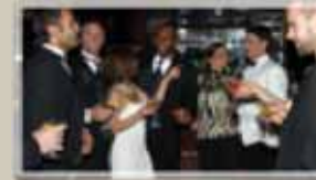
Pre & Post congress activities