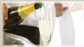
Trendy restaurants and bars