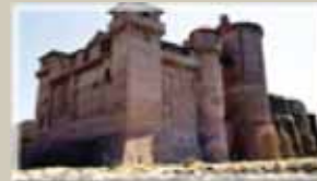
Historical locations, stunning villas, castles