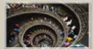
Art and culture