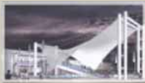
Fairs and exhibition spaces, up to 70.000 sq. mt.