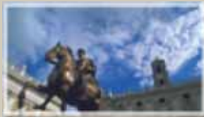
Downtown open spaces