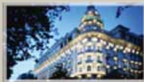
147 hotels with up to 3500 seat capacity