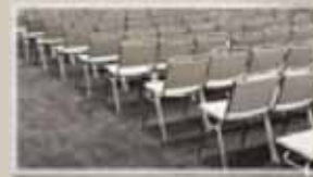
Support and technical services