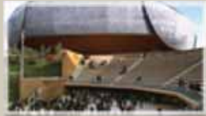
Cultural and social events